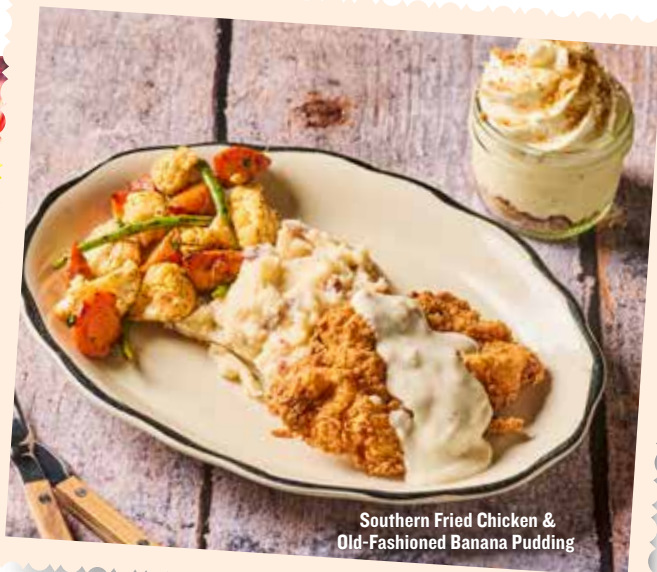
Southern Fried Chicken & Old-Fashioned Banana Pudding