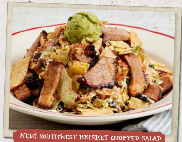
NEW! SOUTHWEST BRISKET CHOPPED SALAD

Grilled chicken breast in original BBQ sauce; tossed with crisp lettuce, BBQ ranch, tomatoes, sweet corn, cucumbers, black beans and cheddar cheese; and topped with crispy onion straws. Half 12.25 | Full 19.25