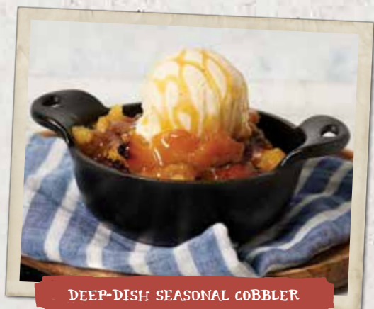
DEEP-DISH SEASONAL COBBLER