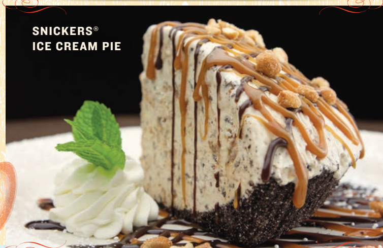
SNICKERS® ICE CREAM PIE