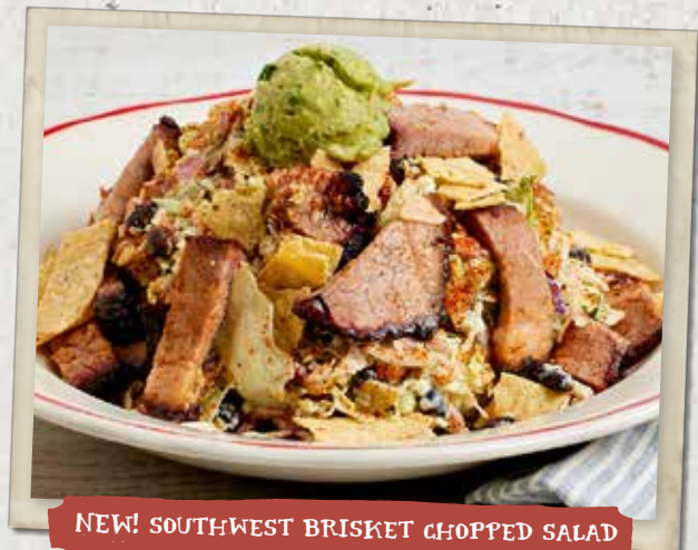
NEW! SOUTHWEST BRISKET CHOPPED SALAD