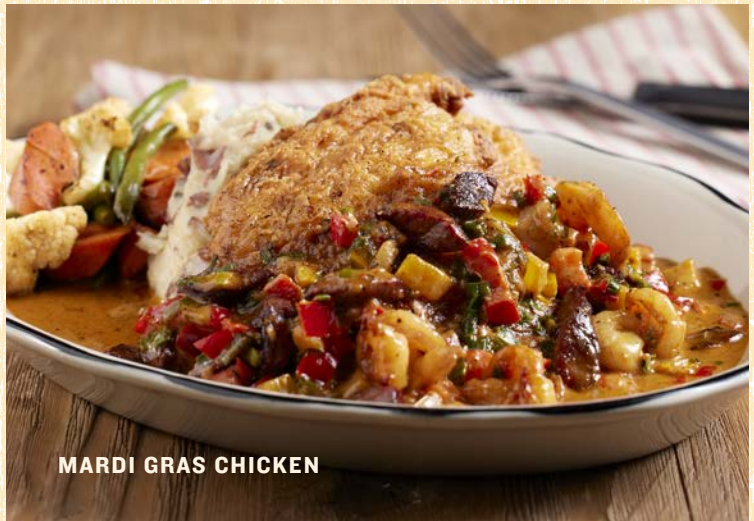
MARDI GRAS CHICKEN