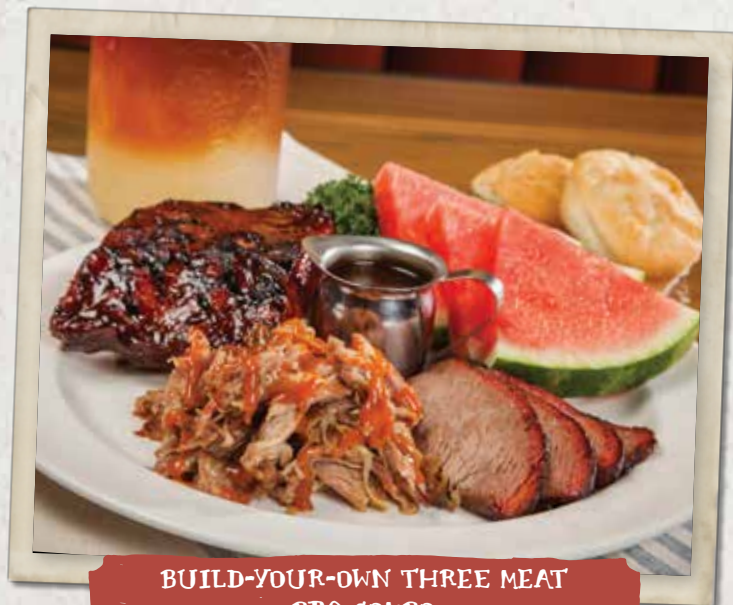
BUILD-YOUR-OWN THREE MEAT BBQ COMBO

RIB TIPS BBQ CHICKEN (1/4) ALABAMA CHICKEN (1/4) TEXAS RED HOT SAUSAGE (1) JALAPEÑO CHEDDAR SAUSAGE (1)