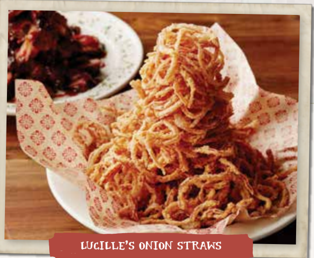
LUCILLE'S ONION STRAWS