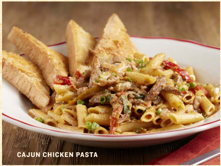
CAJUN CHICKEN PASTA