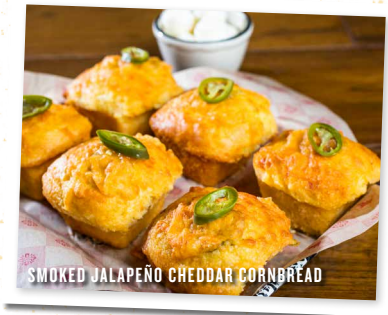
SMOKED JALAPEÑO CHEDDAR CORNBREAD

SMOKED JALAPEÑO CHEDDAR CORNBREAD Half Dozen 9.00 One Dozen 18.00