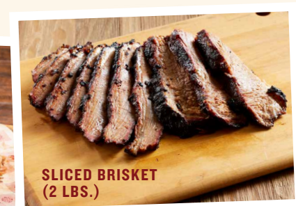
SLICED BRISKET (2 LBS.)