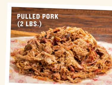
PULLED PORK (2 LBS.)