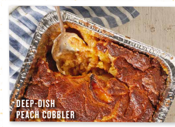
DEEP-DISH PEACH COBBLER

BUTTERMILK DOUBLE CHOCOLATE CAKE Serves up to 16 49.99