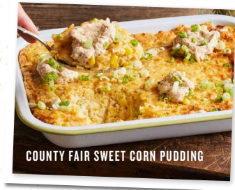
COUNTY FAIR SWEET CORN PUDDING