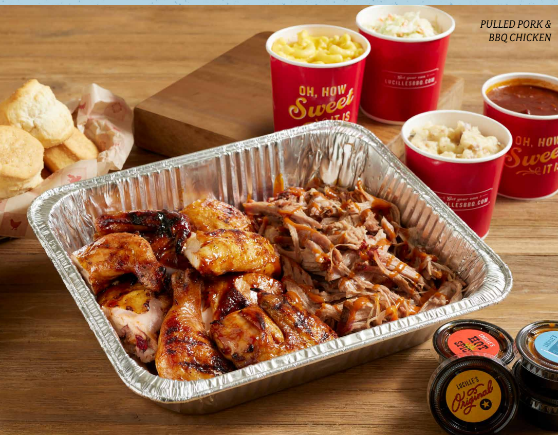
PULLED PORK & BBQ CHICKEN