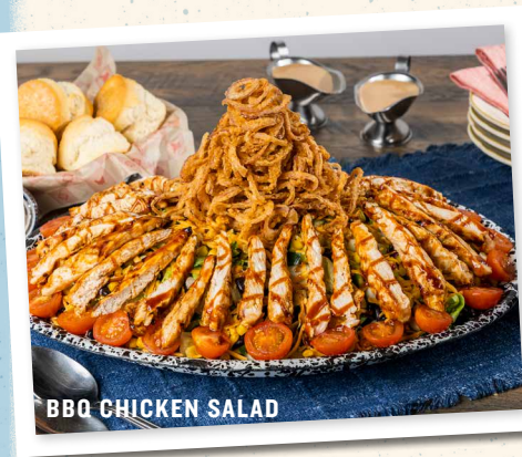
BBQ CHICKEN SALAD