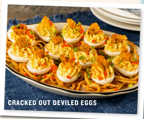
CRACKED OUT DEVILED EGGS