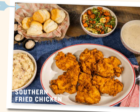
SOUTHERN FRIED CHICKEN

Smoked chicken, spicy hot link, tasso ham and shrimp sautéed in piquante tomato sauce and served over white rice. Spicy! 64.99