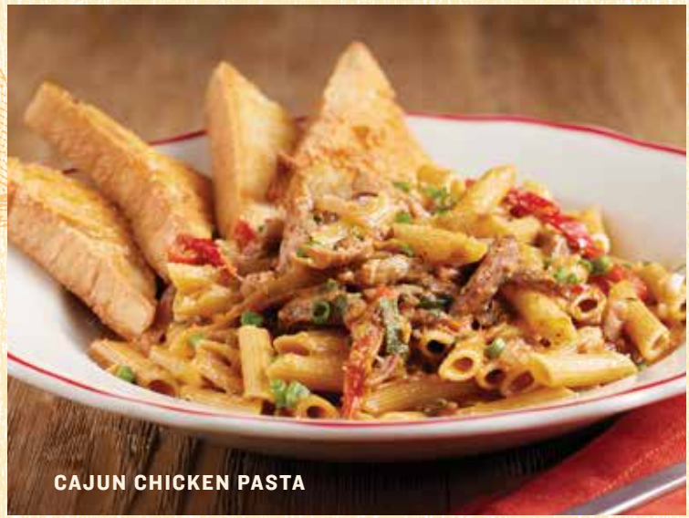
CAJUN CHICKEN PASTA