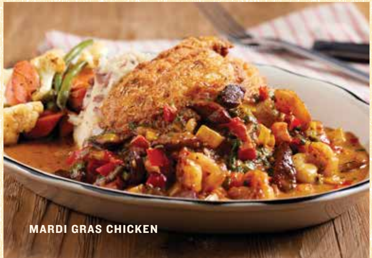
MARDI GRAS CHICKEN

Our guests request this dish the most—enjoy!