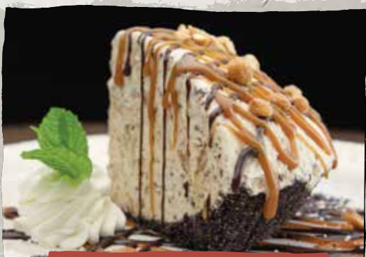
SNICKERS® ICE CREAM PIE

Chopped Snickers® bars mixed with vanilla bean ice cream in a crisp chocolate cookie crust. Served with caramel and chocolate sauce, then topped with peanuts. 8.99