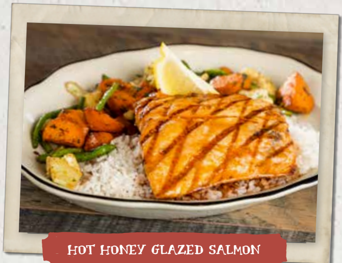
HOT HONEY GLAZED SALMON

A fresh salmon fillet seasoned and grilled to perfection. Served with our creole mustard cream sauce and your choice of two swoon-worthy sides. 26.99