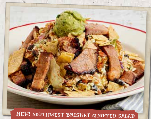
NEW! SOUTHWEST BRISKET CHOPPED SALAD

Grilled chicken breast in original BBQ sauce; tossed with crisp lettuce, BBQ ranch, tomatoes, sweet corn, cucumbers, black beans and cheddar cheese; and topped with crispy onion straws. Half 11.75 | Full 18.75