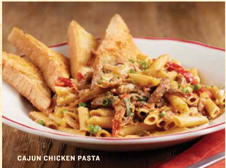
CAJUN CHICKEN PASTA