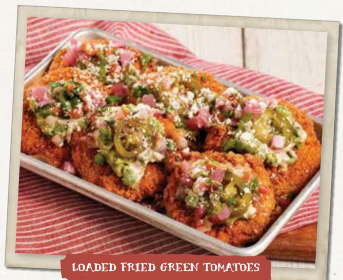
LOADED FRIED GREEN TOMATOES

Cornmeal-crust green tomatoes with housemade guacamole, spicy ranch, pico de gallo, pickled red onions, smoked jalapeños, cotija cheese and cilantro. 11.99