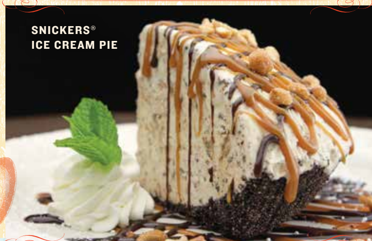
SNICKERS® ICE CREAM PIE

The OG! This delicious creation was on the very first Lucille's menu in 1999. Once you try it, you'll see why it never left!