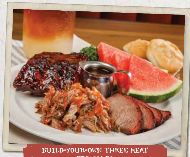
BUILD-YOUR-OWN THREE MEAT BBQ COMBO

SERVED WITH YOUR CHOICE OF ONE SWOON-WORTHY SIDE AND FRESHLY BAKED BISCUIT & APPLE BUTTER