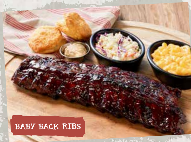
BABY BACK RIBS