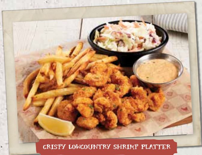
CRISPY LOWCOUNTRY SHRIMP PLATTER

HOUSE SALAD, ADD 5.99 • CAESAR SALAD, ADD 5.99 • WEDGE SALAD, ADD 6.99