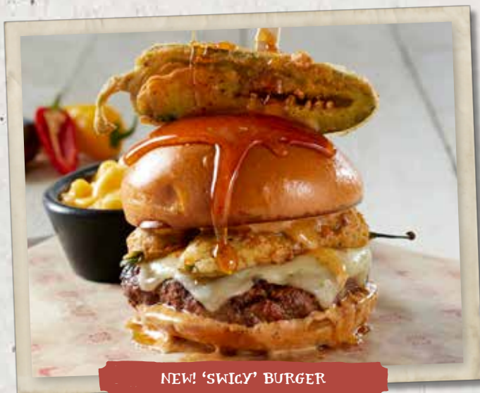
NEW! 'SWICY' BURGER

Our delicious Certified Angus Beef® patties are served on grilled brioche buns.