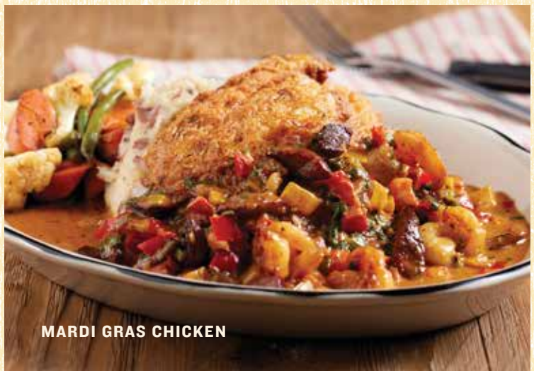
MARDI GRAS CHICKEN

Our guests request this dish the most—enjoy!