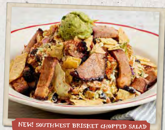
NEW! SOUTHWEST BRISKET CHOPPED SALAD

Grilled chicken breast in original BBQ sauce; tossed with crisp lettuce, BBQ ranch, tomatoes, sweet corn, black beans and cheddar cheese; and topped with crispy onion straws. Half 11.75 | Full 18.75