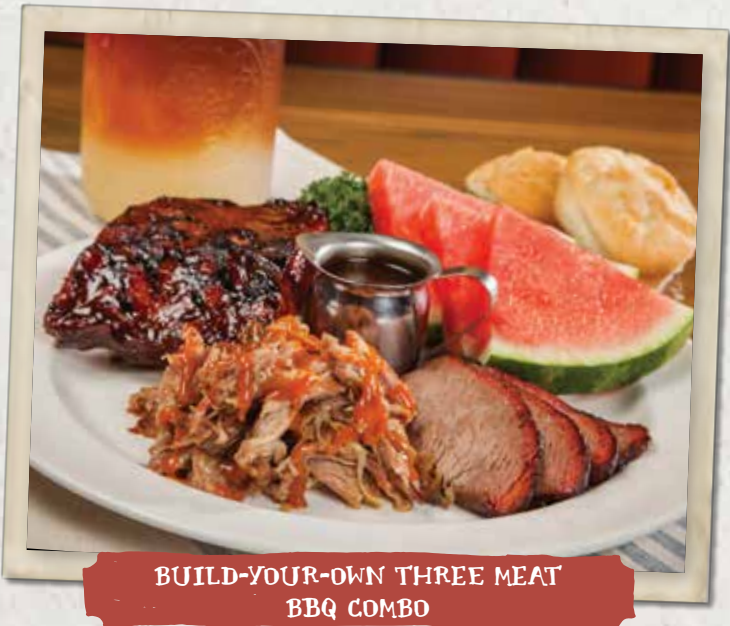
BUILD-YOUR-OWN THREE MEAT BBQ COMBO

RIB TIPS BBQ CHICKEN (1/4) ALABAMA CHICKEN (1/4) TEXAS RED HOT SAUSAGE (1) JALAPEÑO CHEDDAR SAUSAGE (1)