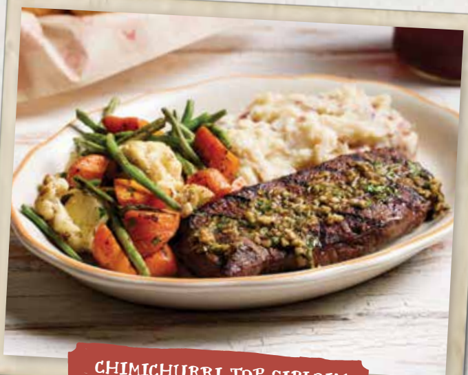
CHIMICHURRI TOP SIRLOIN