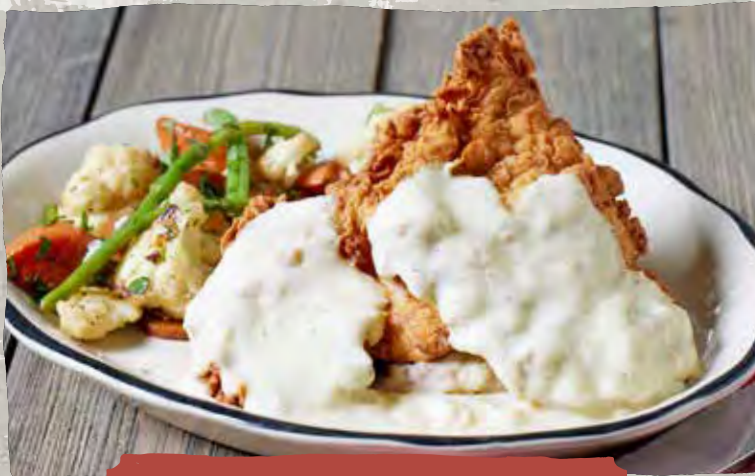
SOUTHERN FRIED CHICKEN

HOUSE SALAD, ADD 5.99 • CAESAR SALAD, ADD 5.99 • WEDGE SALAD, ADD 6.99