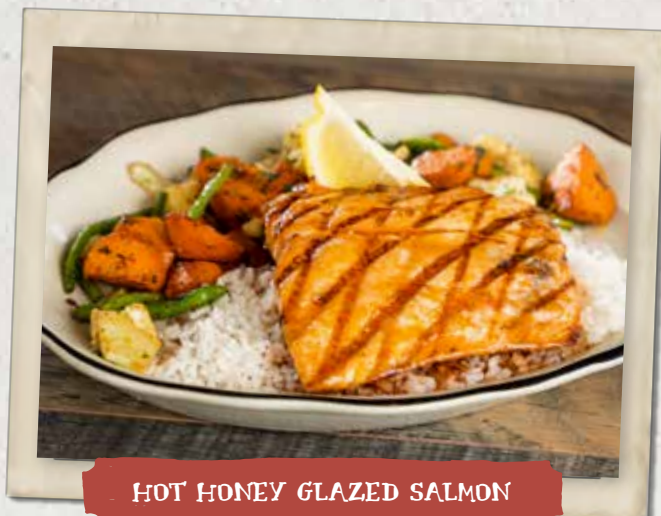
HOT HONEY GLAZED SALMON

A fresh salmon fillet seasoned and grilled to perfection. Served with our creole mustard cream sauce and your choice of two swoon-worthy sides. 26.99