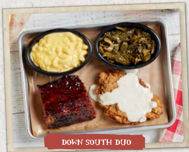
DOWN SOUTH DUO

✂ WE HAND-CARVE OUR MEATS TO ORDER BECAUSE WE BELIEVE A LITTLE EXTRA CARE MAKES FOR THE MOST TENDER, SUCCULENT CUTS OF MEAT.