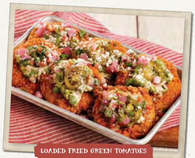
LOADED FRIED GREEN TOMATOES

Cornmeal-crusted green tomatoes with housemade guacamole, spicy ranch, pico de gallo, pickled red onions, smoked jalapeños, cotija cheese and cilantro. 11.99