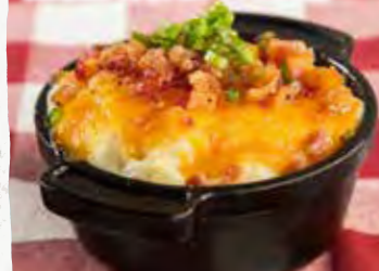
ROASTED STREET CORN