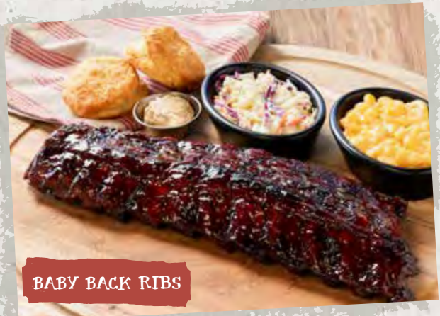
BABY BACK RIBS