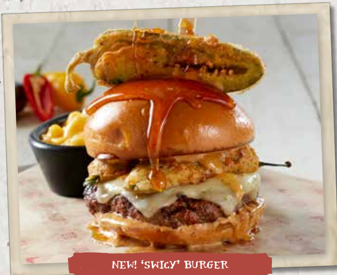
NEW! 'SWICY' BURGER

This flame-grilled patty is basted with our original BBQ sauce and topped with applewood bacon, melted cheddar cheese and onion straws with BBQ ranch dressing. 19.99