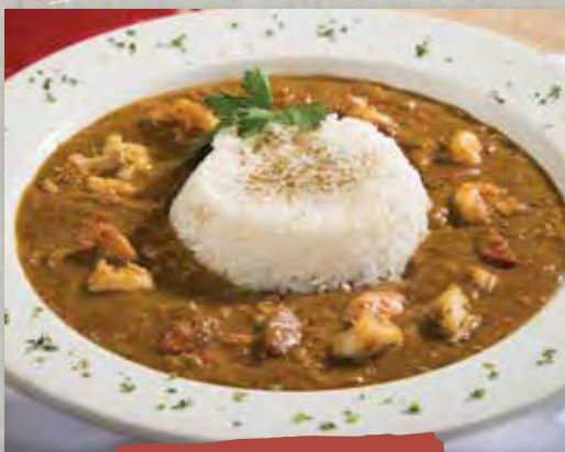
NEW ORLEANS GUMBO