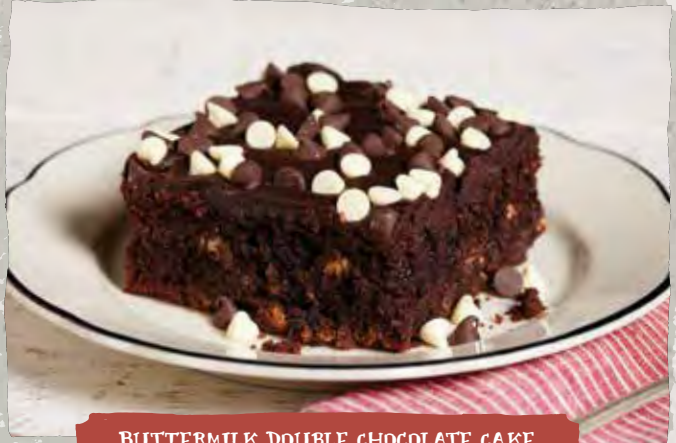
BUTTERMILK DOUBLE CHOCOLATE CAKE