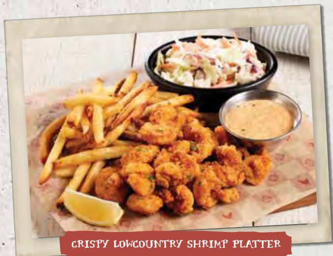
CRISPY LOWCOUNTRY SHRIMP PLATTER

HOUSE SALAD, ADD 5.99 • CAESAR SALAD, ADD 5.99 • WEDGE SALAD, ADD 6.99