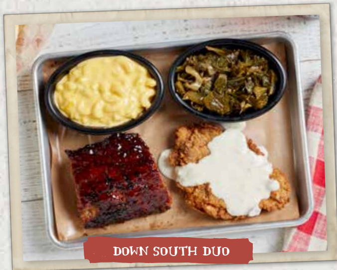
DOWN SOUTH DUO

A half pound of our special pork roast, slow-smoked until it's fork-tender, hand-shredded and tossed in our special sauce and drizzled with Memphis BBQ sauce. 510 cal 21.99