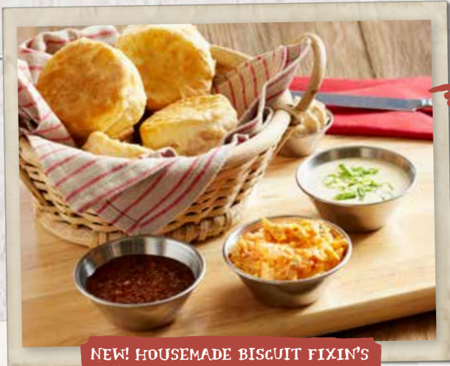
NEW! HOUSEMADE BISCUIT FIXIN'S