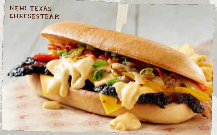
NEW! TEXAS CHEESESTEAK

Substitute a Gardenburger® patty on any sandwich or burger for no charge.