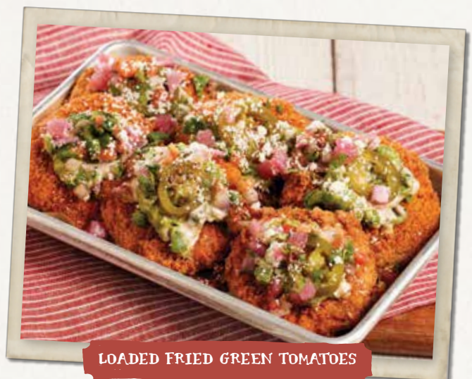
LOADED FRIED GREEN TOMATOES

Cornmeal-crusted green tomatoes with housemade guacamole, spicy ranch, pico de gallo, pickled red onions, smoked jalapeños, cotija cheese and cilantro. 1270 cal 11.99