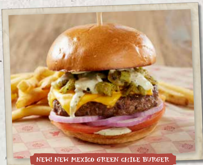
NEW! NEW MEXICO GREEN CHILE BURGER

Substitute a Gardenburger® patty on any sandwich or burger for no charge.