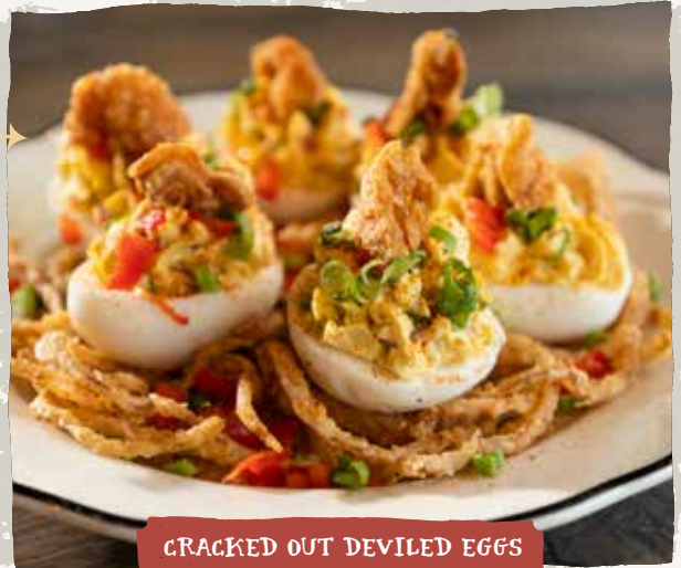
CRACKED OUT DEVEILED EGGS

Classic deviled eggs with crispy bacon, topped with chicken cracklings, green onions, red peppers and special seasonings served atop crispy onion straws. 770 cal 11.50