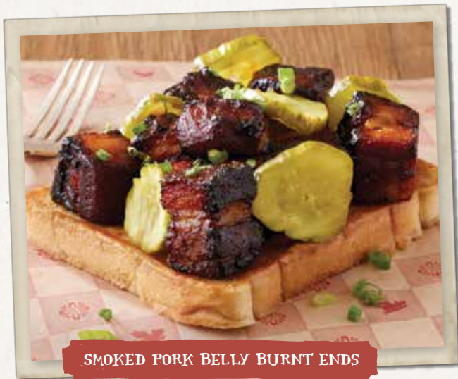
SMOKED PORK BELLY BURNT ENDS

St. Louis pork rib tips marinated in our original BBQ sauce, slowly hickory-smoked and finished on the grill. Half 770 cal 11.75 | Full 1460 cal 15.99