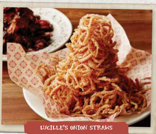
LUCILLE'S ONION STRAWS