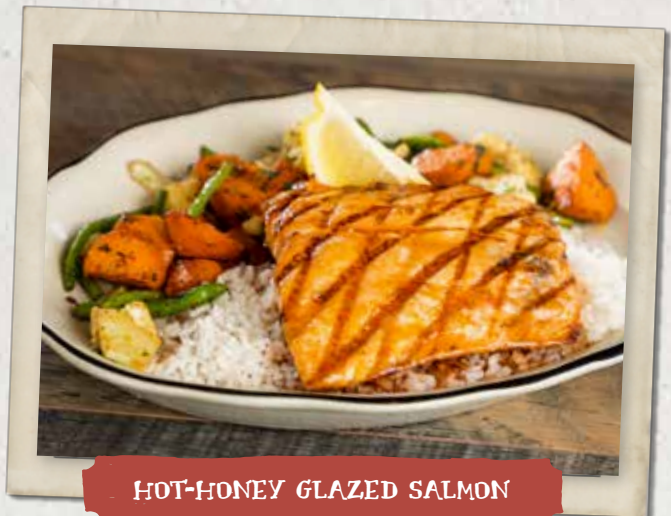
HOT-HONEY GLAZED SALMON

A fresh salmon fillet seasoned and grilled to perfection. Served with our creole mustard cream sauce and your choice of two swoon-worthy sides. 650 cal 26.99