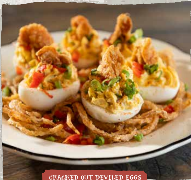
CRACKED OUT DEVEILED EGGS