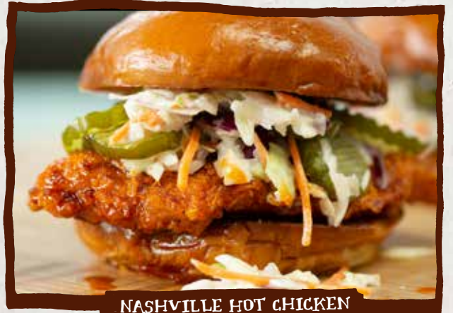
NASHVILLE HOT CHICKEN