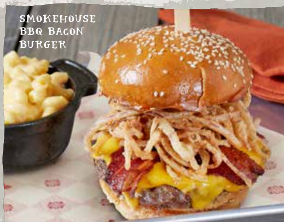
SMOKEHOUSE BBQ BACON BURGER