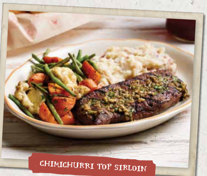
CHIMICHURRI TOP SIRLOIN