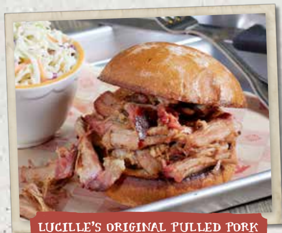
LUCILLE'S ORIGINAL PULLED PORK

Smoked chicken breast lightly grilled and topped with cheddar cheese, applewood bacon, crispy onion straws and lettuce slathered with original BBQ sauce on a grilled brioche bun. 1150 cal 15.50