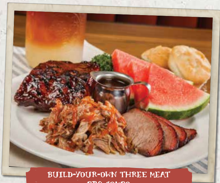
BUILD-YOUR-OWN THREE MEAT BBQ COMBO