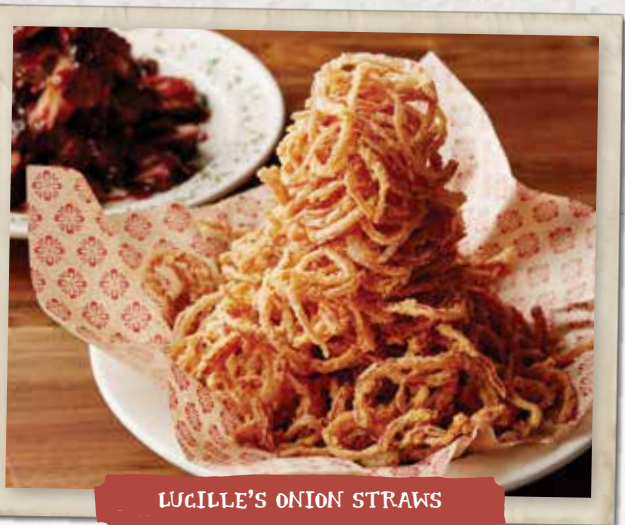
LUCILLE'S ONION STRAWS