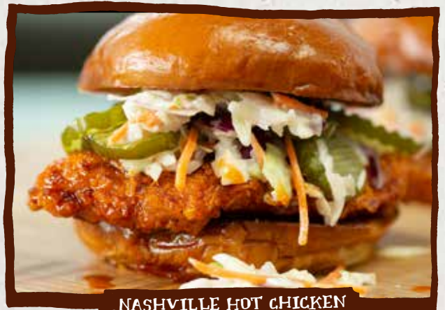
NASHVILLE HOT CHICKEN