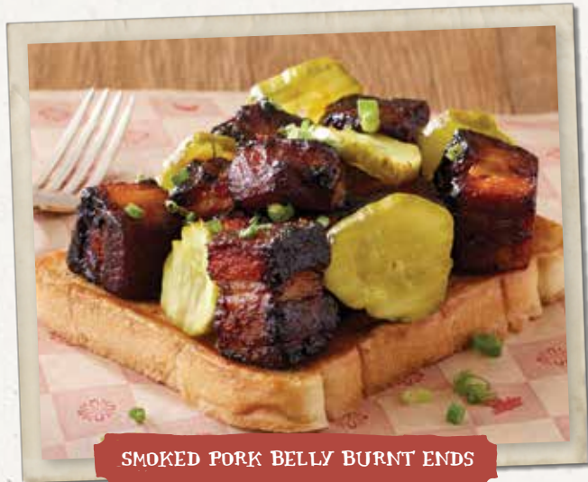
SMOKED PORK BELLY BURNT ENDS

St. Louis pork rib tips marinated in our original BBQ sauce, slowly hickory-smoked and finished on the grill. Half 770 cal 11.75 | Full 1460 cal 15.99