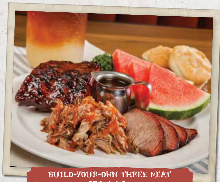
BUILD-YOUR-OWN THREE MEAT BBQ COMBO