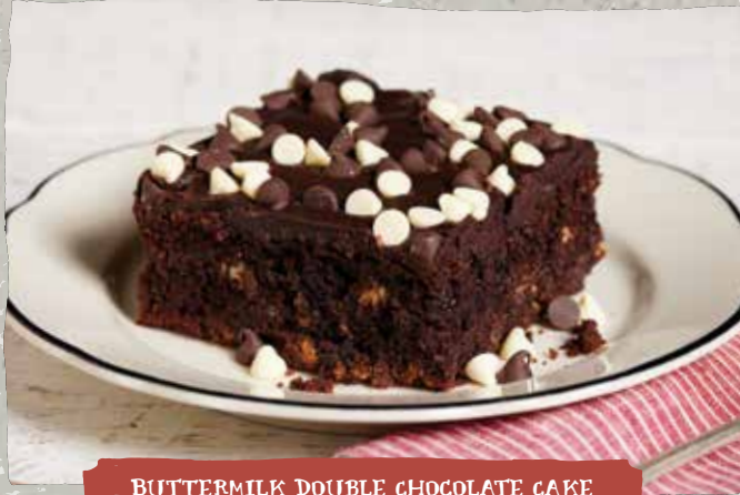
BUTTERMILK DOUBLE CHOCOLATE CAKE