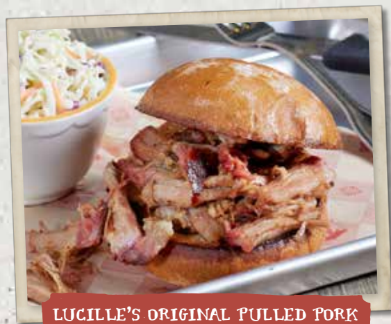
LUCILLE'S ORIGINAL PULLED PORK

Smoked chicken breast lightly grilled and topped with cheddar cheese, applewood bacon, crispy onion straws and lettuce slathered with original BBQ sauce on a grilled brioche bun. 1150 cal 16.99