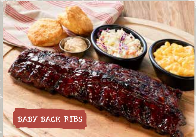
BABY BACK RIBS

✂️ WE HAND-CARVE OUR MEATS TO ORDER BECAUSE WE BELIEVE A LITTLE EXTRA CARE MAKES FOR THE MOST TENDER, SUCCULENT CUTS OF MEAT.