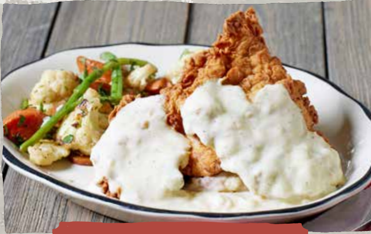
SOUTHERN FRIED CHICKEN

HOUSE SALAD 100 cal, ADD 5.99 • CAESAR SALAD 290 cal, ADD 5.99 • WEDGE SALAD 290 cal, ADD 6.99