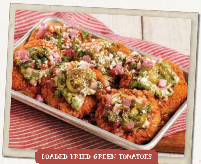
LOADED FRIED GREEN TOMATOES

Cornmeal-crust green tomatoes with housemade guacamole, spicy ranch, pico de gallo, pickled red onions, smoked jalapeños, cotija cheese and cilantro. 1270 cal 11.99