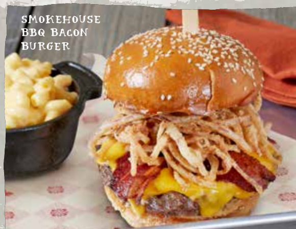
SMOKEHOUSE BBQ BACON BURGER