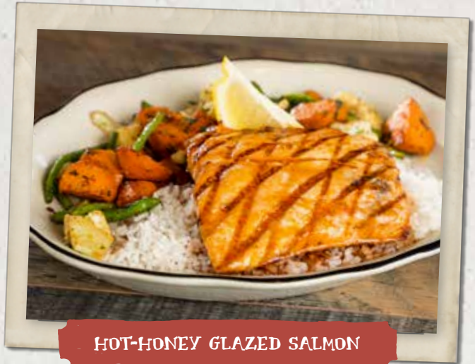
HOT-HONEY GLAZED SALMON

A fresh salmon fillet seasoned and grilled to perfection. Served with our creole mustard cream sauce and your choice of two swoon-worthy sides. 650 cal 26.99