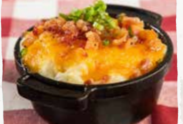
ROASTED STREET CORN