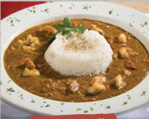
NEW ORLEANS GUMBO