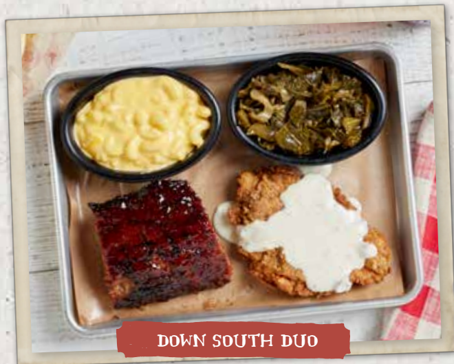
DOWN SOUTH DUO

A half pound of our special pork roast, slow-smoked until it's fork-tender, hand-shredded and tossed in our special sauce and drizzled with Memphis BBQ sauce. 510 cal 21.99