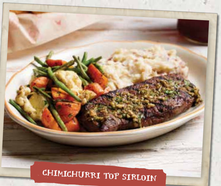
CHIMICHURRI TOP SIRLOIN