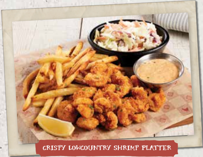
CRISPY LOWCOUNTRY SHRIMP PLATTER

HOUSE SALAD 100 cal, ADD 5.99 • CAESAR SALAD 290 cal, ADD 5.99 • WEDGE SALAD 290 cal, ADD 6.99