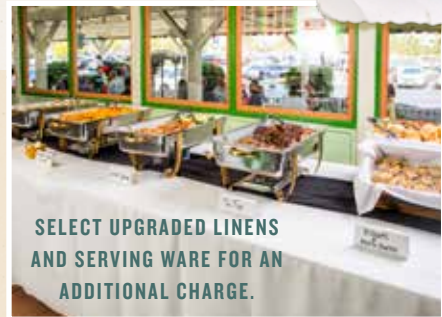
SELECT UPGRADED LINENS AND SERVING WARE FOR AN ADDITIONAL CHARGE.

With our Celebration Menu, you can choose a 2-, 3- or 4-meat item combo with non-alcoholic beverages included. Select from a variety of entrees from our delicious 'que to our famous Jambalaya "Me-Oh-My-A!"