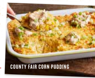
COUNTY FAIR CORN PUDDING