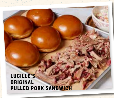
LUCILLE'S ORIGINAL PULLED PORK SANDWICH