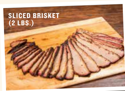
SLICED BRISKET (2 LBS.)