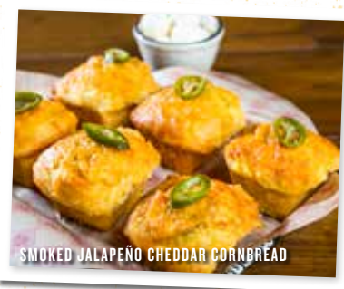
SMOKED JALAPEÑO CHEDDAR CORNBREAD

SMOKED JALAPEÑO CHEDDAR CORNBREAD Half Dozen 2590 cal 9.00 One Dozen 4360 cal 18.00