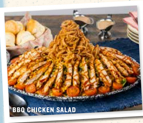
BBQ CHICKEN SALAD