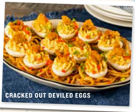
CRACKED OUT DEVILED EGGS