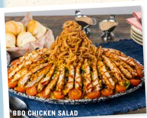
BBQ CHICKEN SALAD