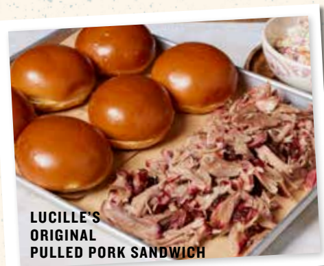
LUCILLE'S ORIGINAL PULLED PORK SANDWICH