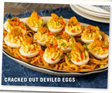
CRACKED OUT DEVILED EGGS