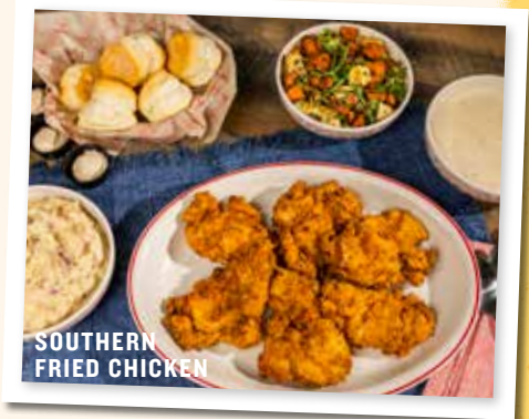
SOUTHERN FRIED CHICKEN

Seasoned and grilled to perfection. With creole mustard sauce, and your choice of two swoon-worthy sides. 2105 cal 69.99