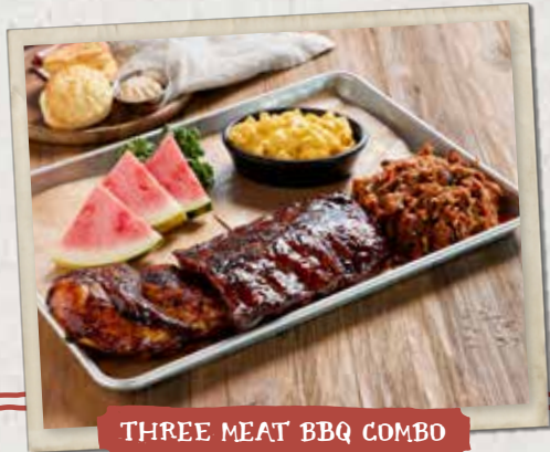
THREE MEAT BBQ COMBO