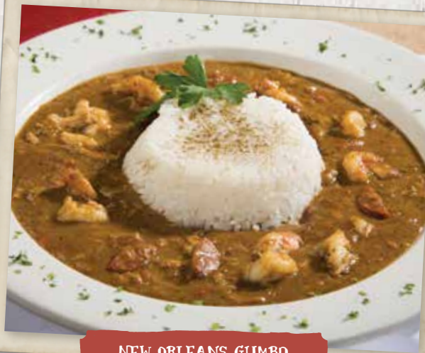
NEW ORLEANS GUMBO