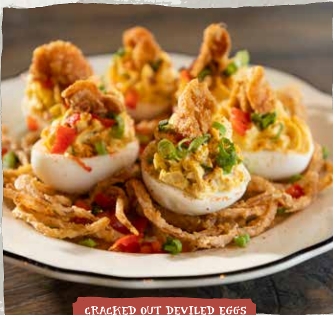
CRACKED OUT DEVEILED EGGS