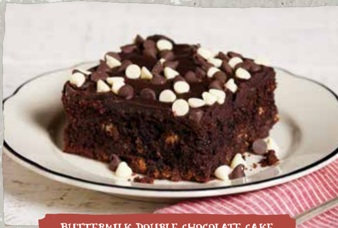
BUTTERMILK DOUBLE CHOCOLATE CAKE