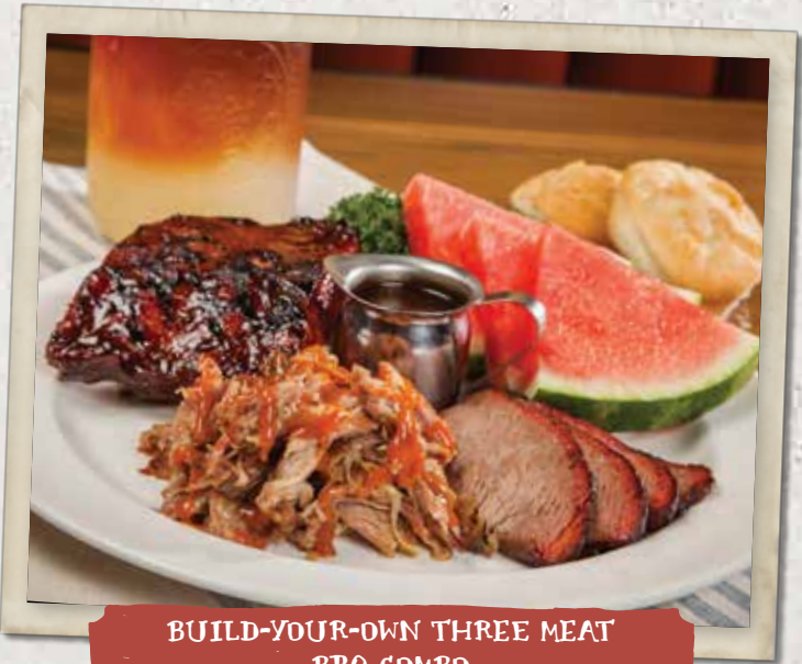
BUILD-YOUR-OWN THREE MEAT BBQ COMBO

SERVED WITH YOUR CHOICE OF ONE SWOON-WORTHY SIDE AND FRESHLY BAKED BISCUIT & APPLE BUTTER 290 cal