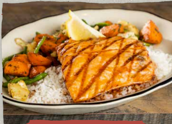
HOT-HONEY GLAZED SALMON

Salmon fillet grilled to perfection and glazed with housemade hot-honey sauce. Served atop a bed of white rice with seasonal sautéed vegetables on the side. 1020 cal 26.99