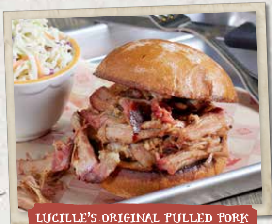
LUCILLE'S ORIGINAL PULLED PORK

Smoked chicken breast lightly grilled and topped with cheddar cheese, applewood bacon, crispy onion straws and lettuce slathered with original BBQ sauce on a grilled brioche bun. 1150 cal 15.50