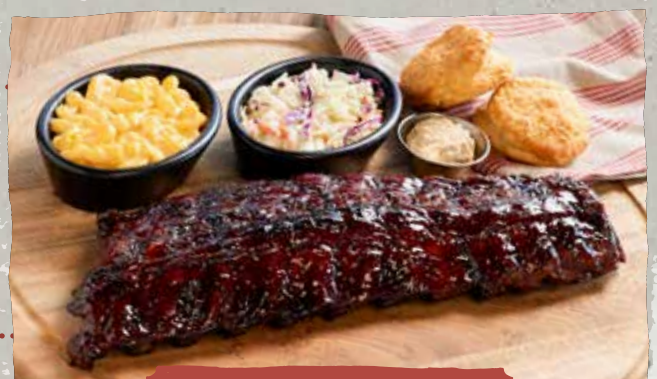
BABY BACK RIBS

✂ WE HAND-CARVE OUR MEATS TO ORDER BECAUSE WE BELIEVE A LITTLE EXTRA CARE MAKES FOR THE MOST TENDER, SUCCULENT CUTS OF MEAT.