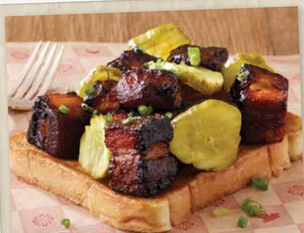
SMOKED PORK BELLY BURNT ENDS

St. Louis pork rib tips marinated in our original BBQ sauce, slowly hickory-smoked and finished on the grill. Half 770 cal 11.25 | Full 1460 cal 15.49