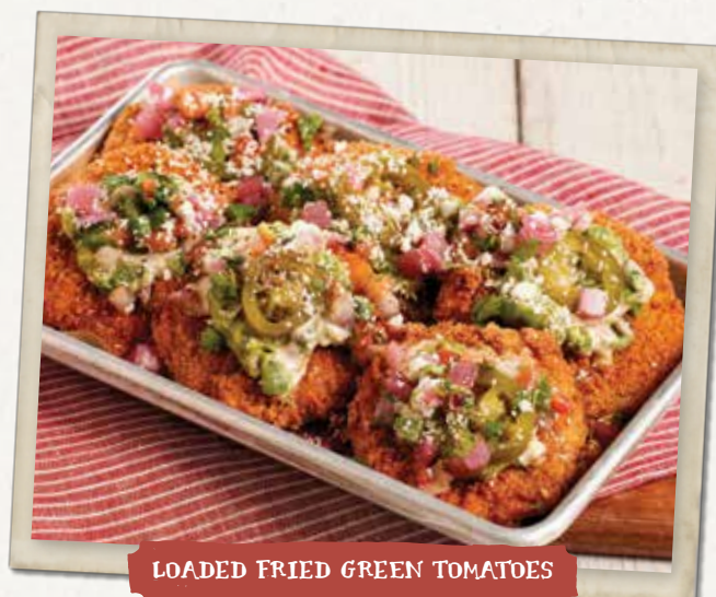
LOADED FRIED GREEN TOMATOES

Cornmeal-crusted green tomatoes with housemade guacamole, spicy ranch, pico de gallo, pickled red onions, smoked jalapeños, cotija cheese and cilantro. 1270 cal 11.99