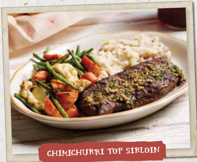
CHIMICHURRI TOP SIRLOIN