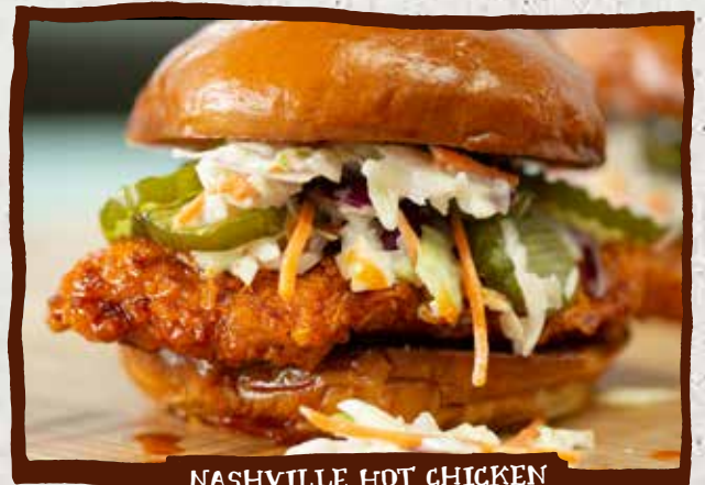
NASHVILLE HOT CHICKEN