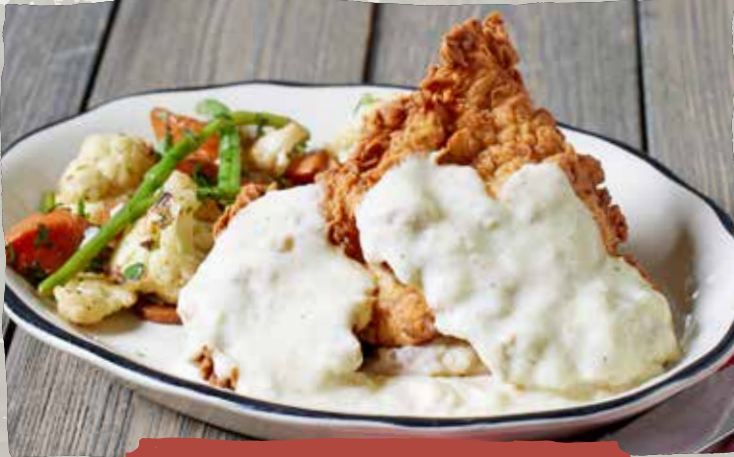
SOUTHERN FRIED CHICKEN

HOUSE SALAD 100 cal, ADD 3.99 • CAESAR SALAD 290 cal, ADD 3.99 • WEDGE SALAD 290 cal, ADD 5.99