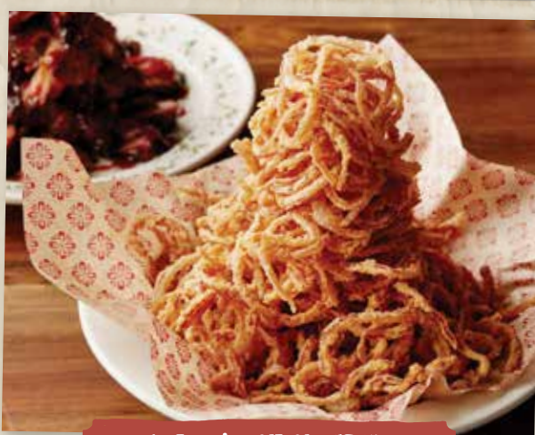
LUCILLE'S ONION STRAWS