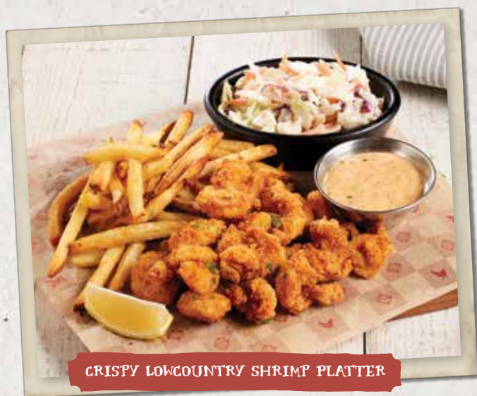
CRISPY LOWCOUNTRY SHRIMP PLATTER