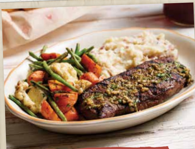
CHIMICHURRI TOP SIRLOIN