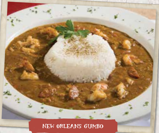
NEW ORLEANS GUMBO