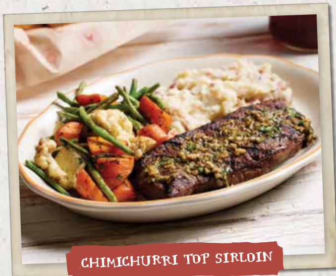
CHIMICHURRI TOP SIRLOIN