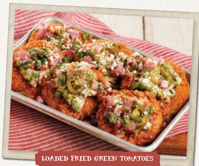
LOADED FRIED GREEN TOMATOES

Cornmeal-crusted green tomatoes with housemade guacamole, spicy ranch, pico de gallo, pickled red onions, smoked jalapeños, cotija cheese and cilantro. 1270 cal 11.99