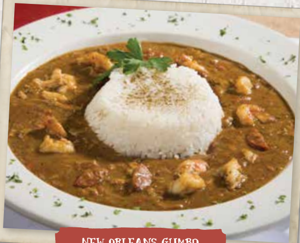
NEW ORLEANS GUMBO