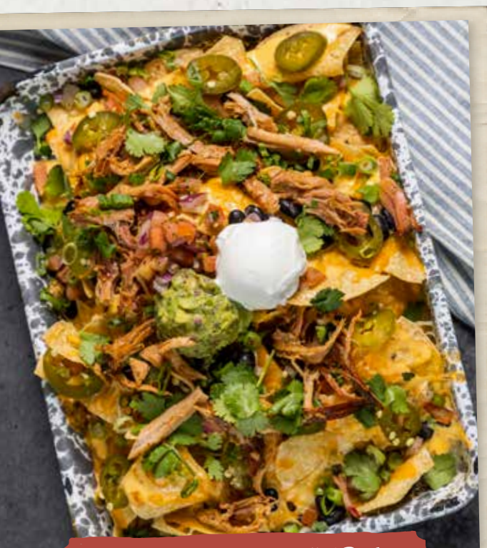
BBQ NACHOS WITH Pulled Pork

MONDAY - FRIDAY • 3 P.M. - 7 P.M. • EVERY DAY • 9 P.M. - CLOSE