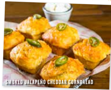
SMOKED JALAPEÑO CHEDDAR CORNBREAD Half Dozen 2590 cal 9.00 One Dozen 4360 cal 18.00