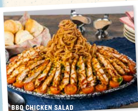
BBQ CHICKEN SALAD

TRI TIP SALAD With tomato vinaigrette. 3300 cal 69.99