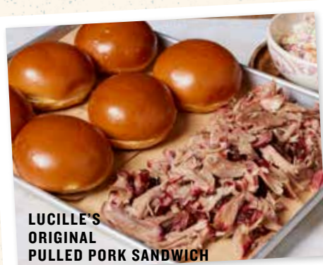
LUCILLE'S ORIGINAL PULLED PORK SANDWICH