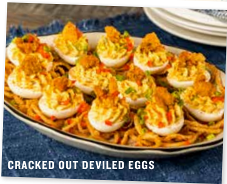
CRACKED OUT DEVILED EGGS

LUCILLE'S ONION STRAWS With BBQ ranch. 2260 cal 17.99