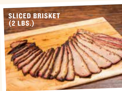
SLICED BRISKET (2 LBS.)