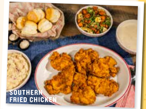
SOUTHERN FRIED CHICKEN

Seasoned and grilled to perfection. With creole mustard sauce, and your choice of two swoon-worthy sides. 2105 cal 69.99