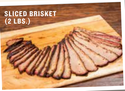
SLICED BRISKET (2 LBS.)