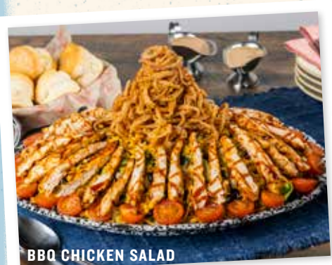
BBQ CHICKEN SALAD

TRI TIP SALAD With tomato vinaigrette. 3300 cal 69.99