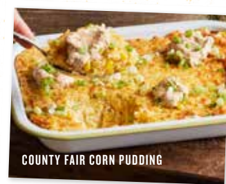
COUNTY FAIR CORN PUDDING