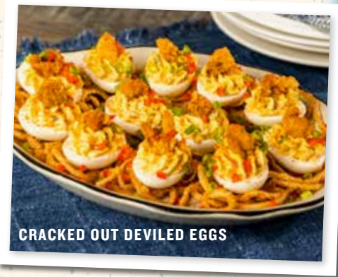
CRACKED OUT DEVILED EGGS

LUCILLE'S ONION STRAWS With BBQ ranch. 2260 cal 17.99