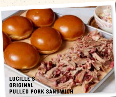
LUCILLE'S ORIGINAL PULLED PORK SANDWICH