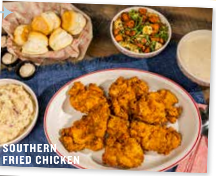
SOUTHERN FRIED CHICKEN

Seasoned and grilled to perfection. With creole mustard sauce, and your choice of two swoon-worthy sides. 2105 cal 69.99