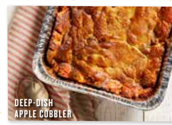
DEEP-DISH APPLE COBBLER