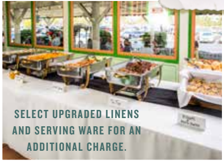
SELECT UPGRADED LINENS AND SERVING WARE FOR AN ADDITIONAL CHARGE.

With our Celebration Menu, you can choose a 2-, 3- or 4-meat item combo with non-alcoholic beverages included. Select from a variety of entrees from our delicious 'que to our famous Jambalaya "Me-Oh-My-A!"