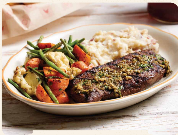
CHIMICHURRI TOP SIRLOIN

Tender sirloin steak chargrilled to order and topped with housemade Hatch chimichurri sauce. Served with garlic mashed potatoes and seasonal sautéed vegetables. 1140 cal