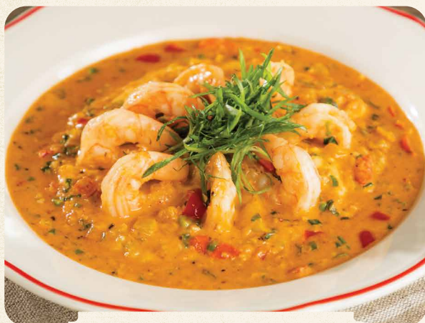
SHRIMP & GRITS

Add a House Salad 100 cal or Caesar Salad 290 cal