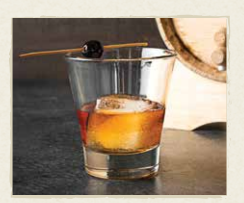
BARREL-AGED MANHATTAN Maker's Mark Bourbon, Carpano Antica, Heering Cherry Liqueur and black walnut bitters. 9.00