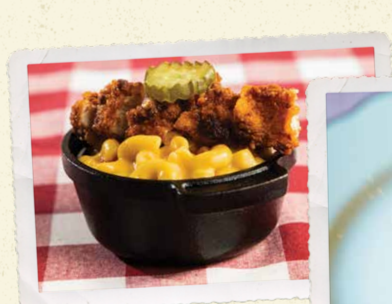
NASHVILLE MAC & CHEESE

UPGRADE TO A PREMIUM SIDE FOR $1.50 OR ADD A PREMIUM SIDE FOR $3.99.