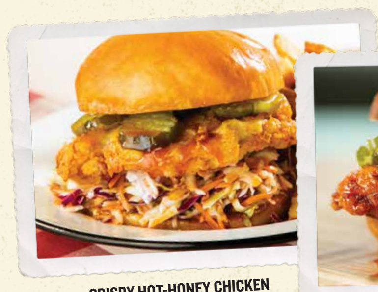
CRISPY HOT-HONEY CHICKEN

Cauliflower florets tossed in our signature seasoned breading and lightly fried, then sprinkled with our special seasoning to deliver a crispy crunch. Served with signature BBQ ranch and a smokin' hot-honey infusion. 8.99