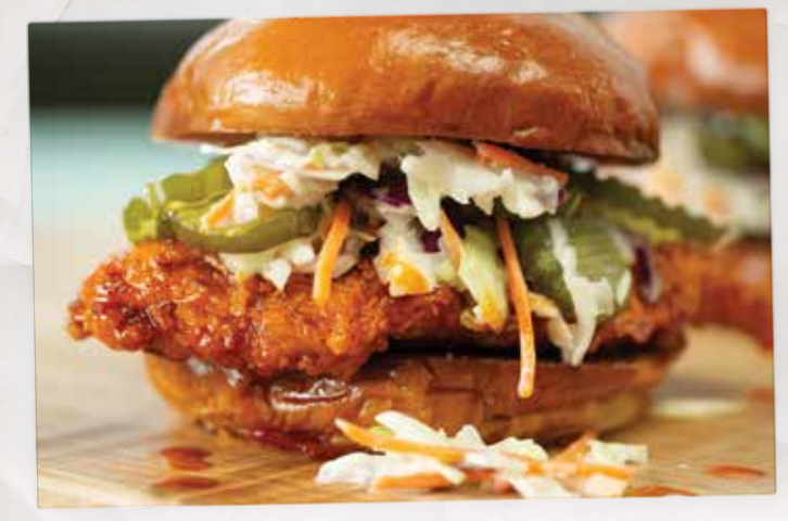
NASHVILLE HOT CHICKEN