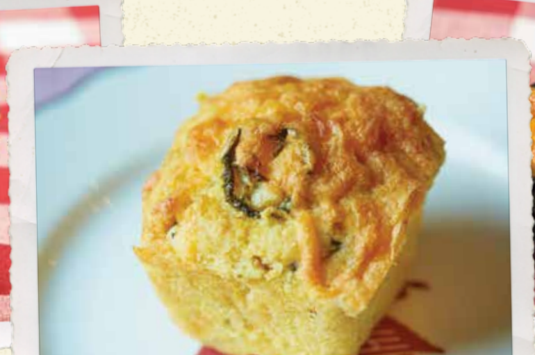
JALAPEÑO CHEDDAR CORNBREAD