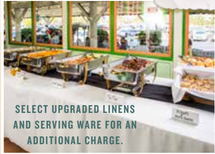
SELECT UPGRADED LINENS AND SERVING WARE FOR AN ADDITIONAL CHARGE.

With our Celebration Menu, you can choose a 2-, 3- or 4-meat item combo with non-alcoholic beverages included. Select from a variety of entrees from our delicious 'que to our famous Jambalaya "Me-Oh-My-A!"